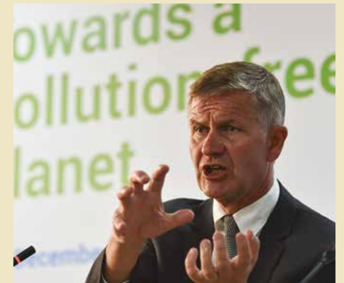
Erik Solheim, Executive Director, UN Environment

"I very much welcome the Child Health Initiative. Children are much more vulnerable to pollution than we adults are. So we should make sure that the road from home to school is safe; safe from accidents and safe from pollution."