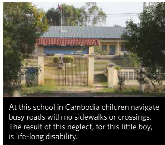
At this school in Cambodia children navigate busy roads with no sidewalks or crossings. The result of this neglect, for this little boy, is life-long disability.

Time and again, across the developing world, we find examples of schools sited alongside high speed roads, with minimal facilities to enable children to travel safely. Technical surveys on thousands of kilometres of road in dozens of countries, undertaken by our partner iRAP, show that more than 80% of roads with vehicle speeds of more than 40km/h – roads used by pedestrians – have no viable footpath. Millions of children are placed in harm's way, and hundreds die every day, because basic infrastructure is not being provided. It is these same schools, serving the lowest income communities, which also suffer the worst local air quality.